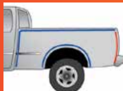
Truck box side panel