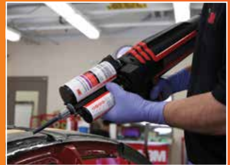
Roof Panel Bonding