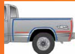
Truck box side assembly